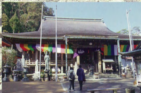
Nachisan Seiganto-ji (Temple)