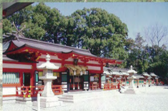
Kumano Hayatama Taisha (Grand Shrine)