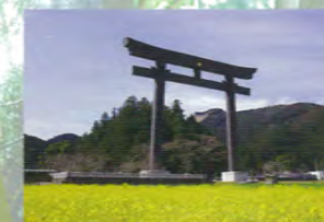
Oyunohara, the original site of Kumano Hongu Taisha