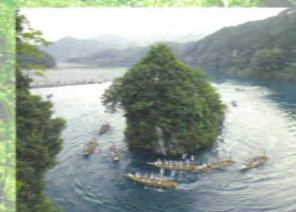
Mifune (boat) Festival (October 16th)