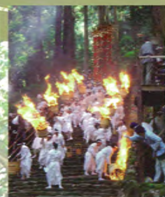
Nachi-no-Ogi Matsuri (Nachi Fire Festival)

The main diety is Fusumi-no-okami (Izanami-no-mikoto) and the Honji-butsum(Honji Buddha) is Senju Kannon.(thousand armed Kannon)