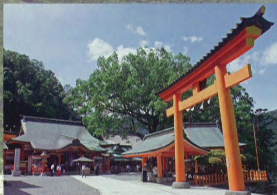
Kumano Nachi Taisha (Grand Shrine)