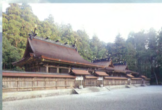
Kumano Hongu Taisha (Grand Shrine)