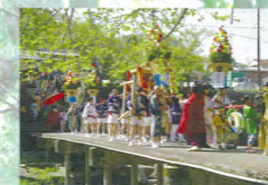
The annual festival of Kumano Hongu Taisha (April 15th)