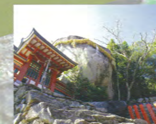
The big Gotobiki(toad) rock of Kamikura-jinja Shrine