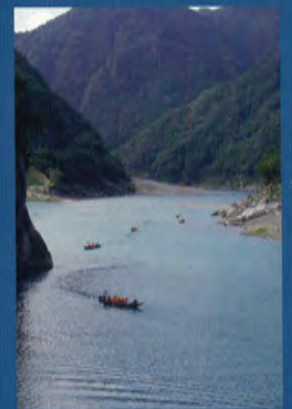
Kumano-gawa River (Section of Kumano Kodo)