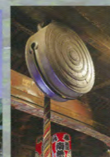
The huge 450kg gong of Nachisan Seiganto-ji Temple

In the ancient times, this temple was integrated as a "Nyoirin-do" with Kumano Nachi Taisha. It is the first temple of Kansai 33 Kannon pilgrimage. The principal image is Nyoirinkanzeon-bosatsu (Goddess of mercy ) that allegedly appeared in Nachi Waterfall.